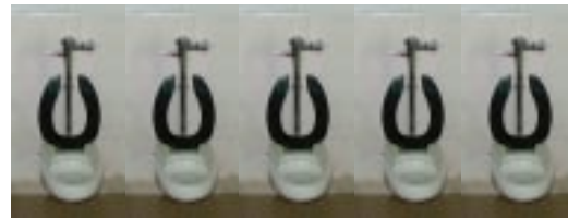
To improve efficiency and relationships

Despite being mildly disturbing, the bathroom remodeling may be an answer to some of Central's financial woes. These kinds of financial cuts are something to look for in the future and hopefully we can make some headway on the deficit.