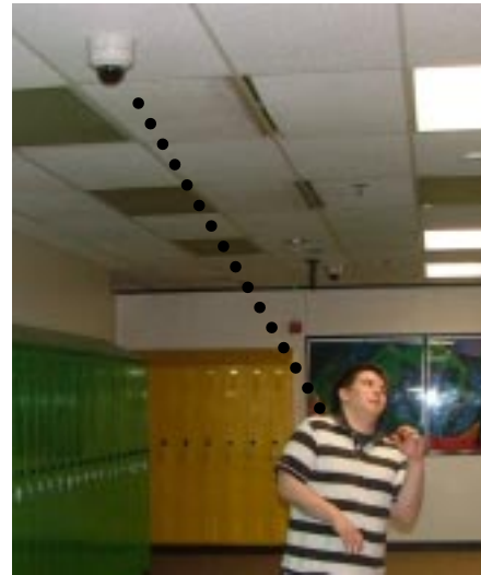
LASERTEC in action

The LASERTEC system operates primarily upon a database-cross-referencing system that allows individual security cameras to see, record,